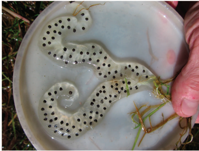
Figure 3. Digital image of Salamandrella keyserlingii spawn. Note that the spawn is spread so that every egg is visible and easy to count.