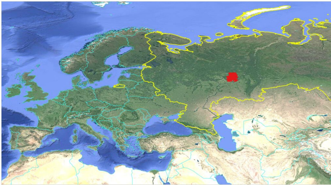
Figure 3. doi

Step description: The dataset is not a part of any ongoing projects.