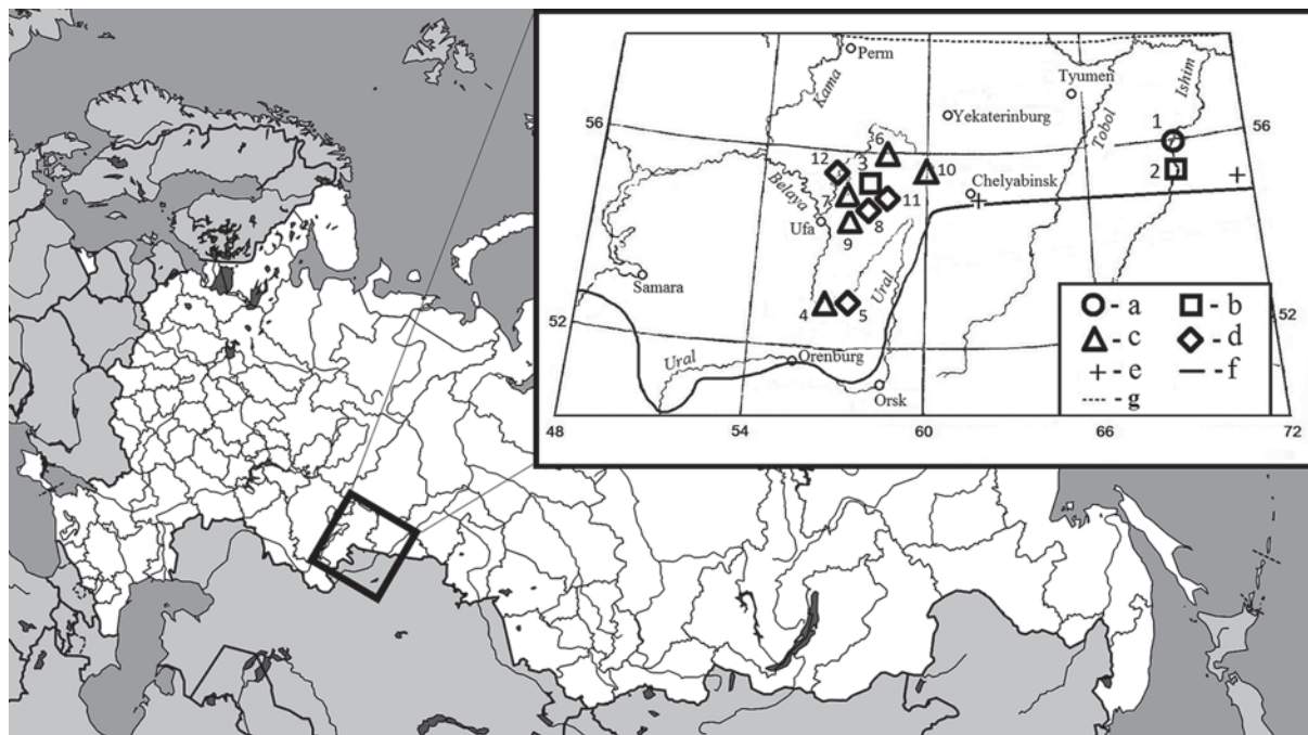
Fig. 1. Holocene localities with marten remains. Legend: a — AT, b — SB, c — SA1, d — SA2, e — data on sable hunting in the XVII–XVIII centuries (Kirikov, 1959), f — southern border of modern distribution of the pine marten, g — southern border of modern distribution of the sable. 1 — Mergen 6, 2 — Balandino, 3 — Yukalikulevo, 4 — Tashmurun (SA1), 5 — Tashmurun (SA2), 6 — Serny kluch, 7 — Podpornaya, 8 — Kalinovskaya, 9 — Atysh, 10 — Berezki Vv, 11 — Staroe logovo, 12 — Barsuchy Dol.

the past (Kosintsev & Gasilin, 2011; Gasilin et al. , 2013). The same is observed in the present time (Heptner et al. , 1967; Nasimovich, 1973). Correct species identification becomes essential for those closely related species which ranges are sympatric. The postcranial skeletal elements of marten species are morphologically similar which makes their species identification rather difficult (Ambros & Hilpert, 2005). Diagnostic features of the skull are often used for species identification (Altuna, 1973; Smirnov, 1975; Gerasimov, 1985; Aristov & Baryshnikov, 2001; Loy et al. , 2004; Monakhov, 2008, 2012; Ranyuk & Monakhov, 2011, 2015), but in fossil material complete skulls are rare and bone fragments and isolated teeth are more common. Tooth morphotypes and their variability also can be used for discrimination between marten species (Miller, 1912; Ognev, 1931; Pavlinin, 1963; Wolsan et al. , 1985, 1989; Gasilin & Kosintsev, 2013; Gimranov & Kosintsev, 2015).