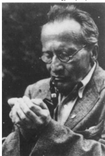
Erwin Schrödinger: engaging writer.