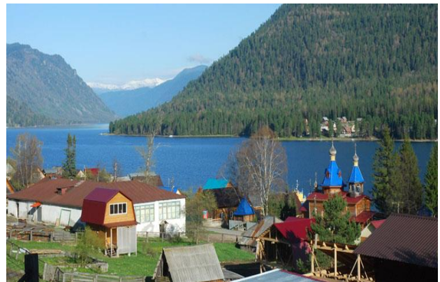
Figures. Teletskoye Lake.