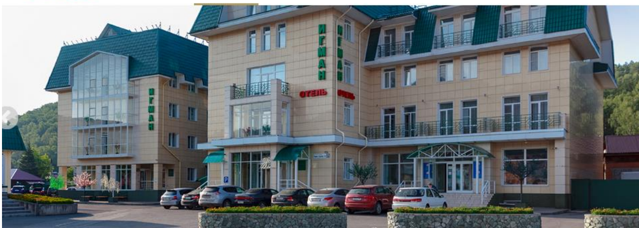
Figure. Igman Hotel.

Об отеле Номера ▾ Отзывы Бронирование Услуги ▾ Контакты