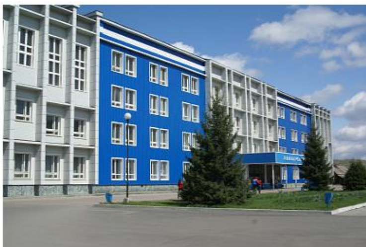
Figure. Main building of Gorno-Altai State University.

The Opening Ceremony of ISAM 11 and plenary talks will be held August 3 at 10 a.m. in the main building of Gorno-Altai State University (Room № 143, 2nd Floor, Lenkin Str., 2, Gorno-Altai town, Altai Republic). https://eduscan.net/colleges/gasu